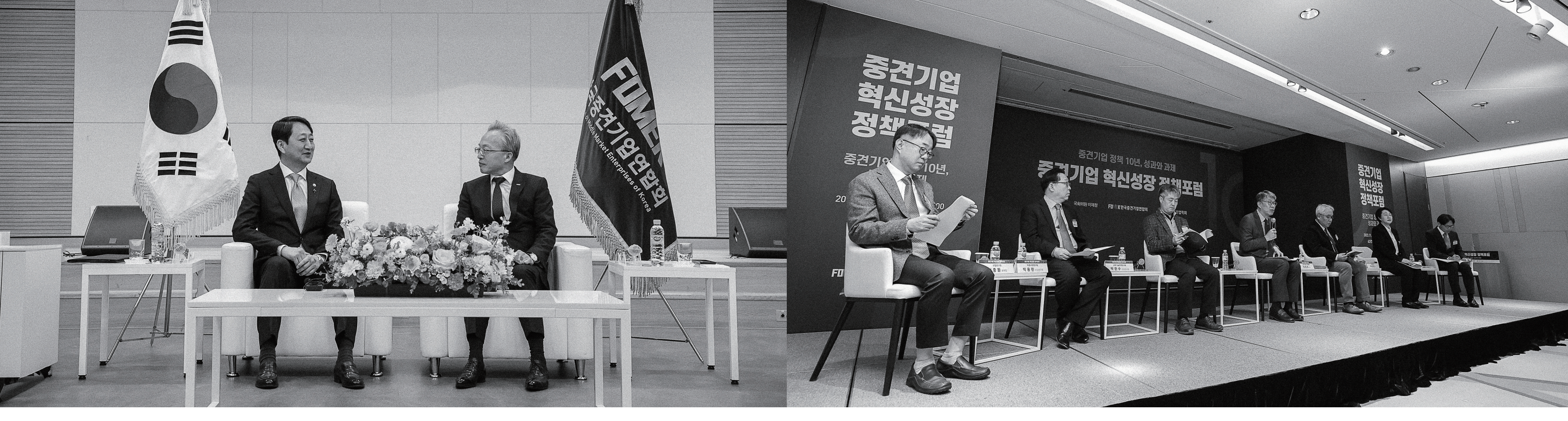
MME policy roundtable with Trade, Industry and Energy Minister Ahn Duk-geun Jan. 22, 2024